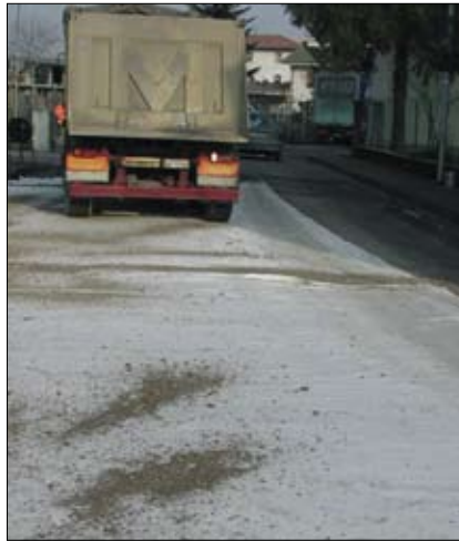
rinforzo stradale / asphalt reinforcement