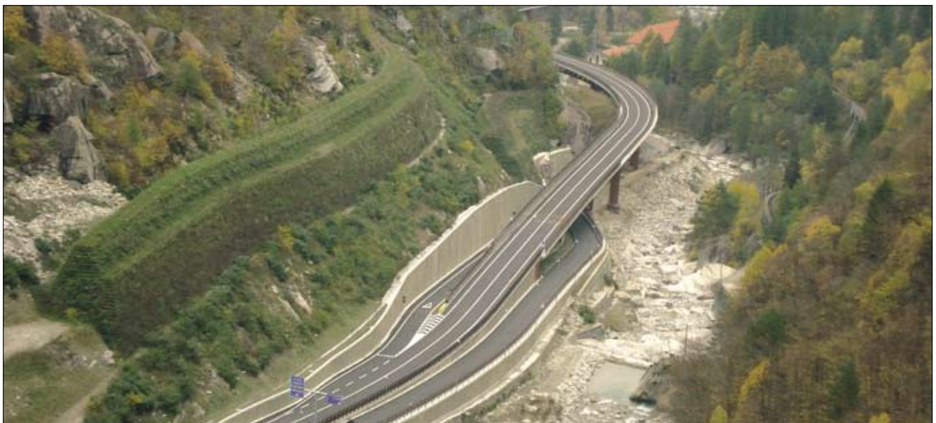
muro paramassi / containing wall

Alpe Adria Textil Srl reserves for itself the right to modify, without any notice, technical and aesthetic characteristics of its products based on continuous technological evolution.