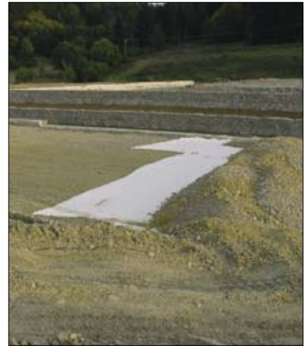
rilevato ferroviario / railway subgrades