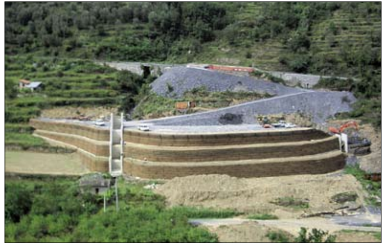
terra rinforzata / reinforced grounds