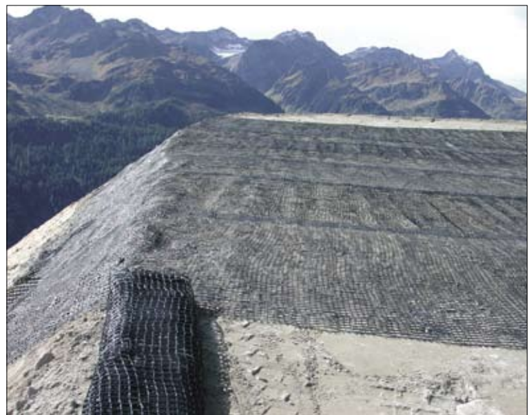
muro paravalanghe / avalanche barrier

Alpe Adria Textil Srl reserves for itself the right to modify, without any notice, technical and aesthetic characteristics of its products based on continuous technological evolution.