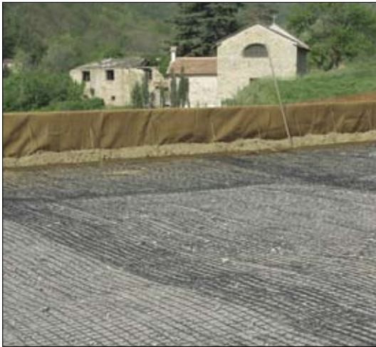
terra rinforzata / reinforced grounds