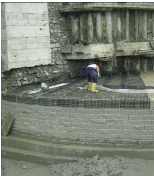
muro rinforzato / reinforced wall